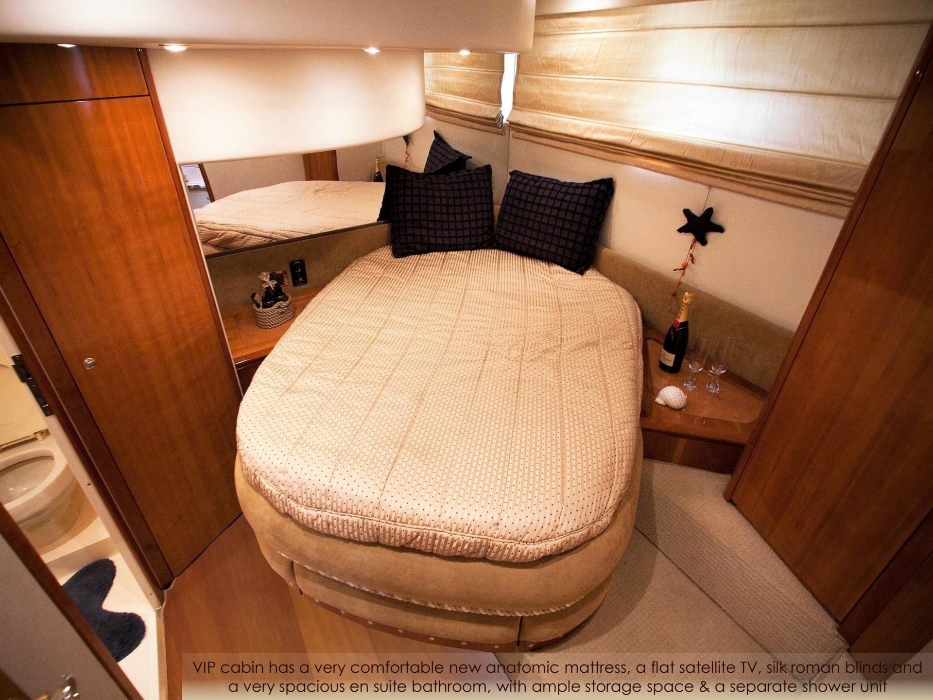
VIP cabin has a very comfortable new anatomic mattress, a flat satellite TV, silk roman blinds and a very spacious en suite bathroom, with ample storage space & a separate shower unit