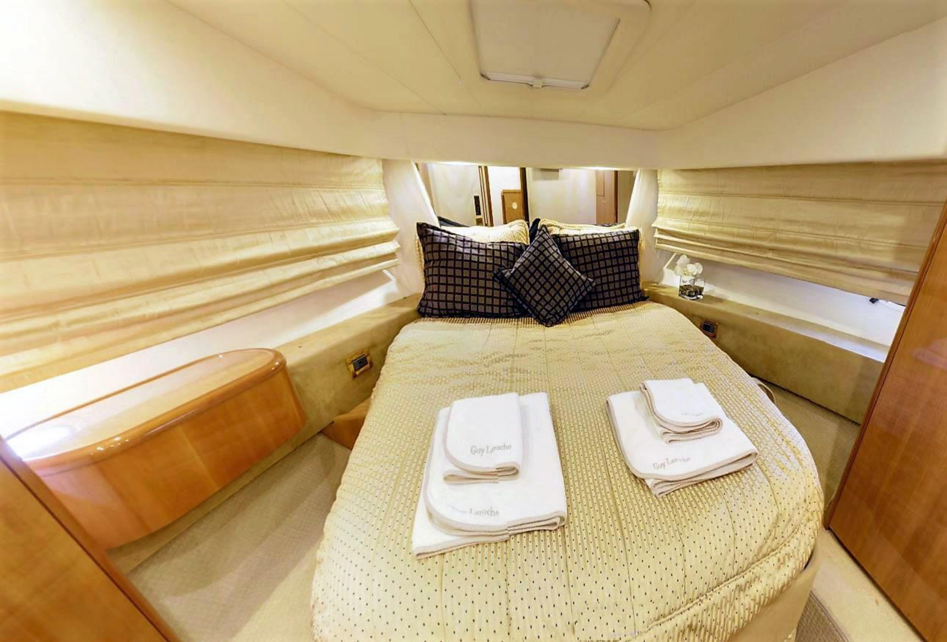
Master cabin has a very comfortable new anatomic mattress, silk roman blinds, flat satellite TV & a very spacious en suite bathroom with ample storage space & separate shower unit