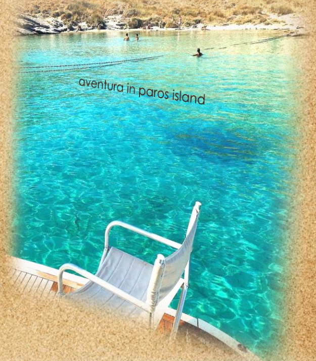
aventura in paros island