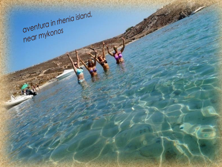
aventura in rhenia island, near mykonos