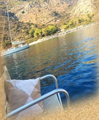
aventura in hydra