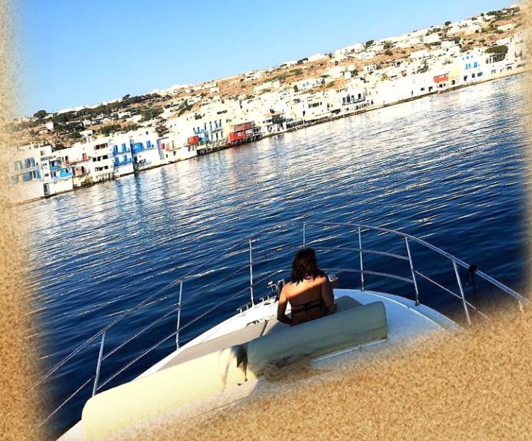
aventura in mykonos island