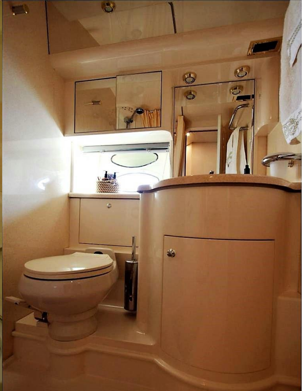
The third bathroom has a shower and is located in the corridor to be used also as day head