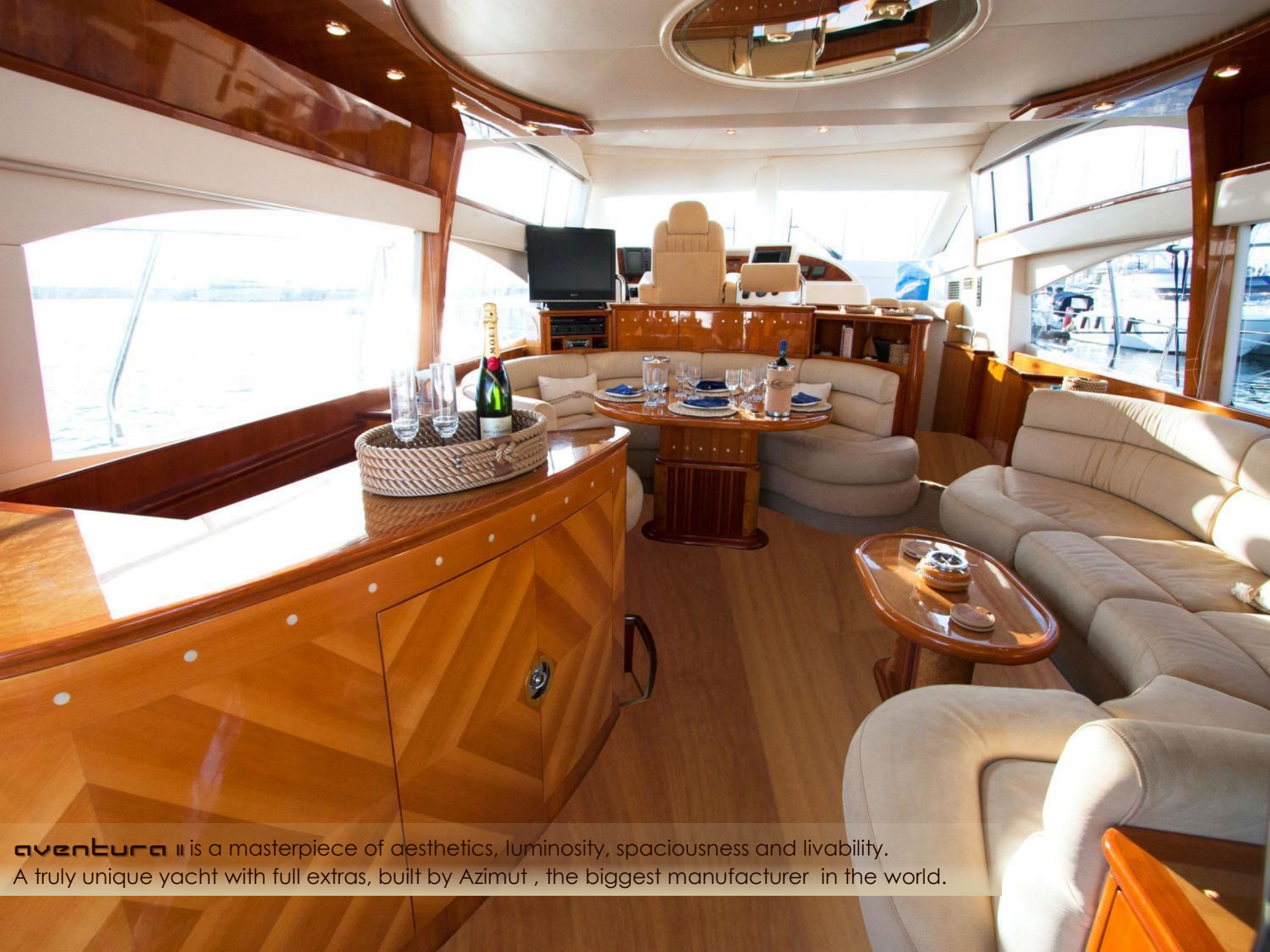
aventura II is a masterpiece of aesthetics, luminosity, spaciousness and livability. A truly unique yacht with full extras, built by Azimut , the biggest manufacturer in the world.